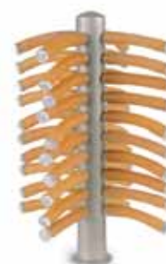
40 port manifold