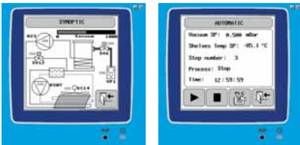
LyoAlfa 10/15 control panel screens

This model incorporates unique and high level control performances, as well as excellent technical features.