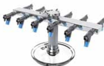
Stackable 12 port manifold with adaptor plate