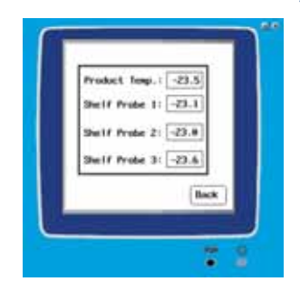
LyoQuest control panel screens

Based on more than 40 years of experience, Telstar introduces the LyoQuest as state of the art in performance and process control. The unit was specifically developed for basic research in biotechnology and scientific institutes.