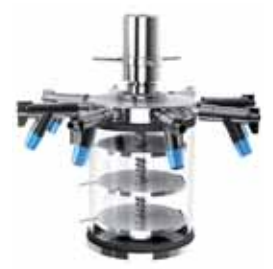
Standard stoppering chamber with 8 port manifold