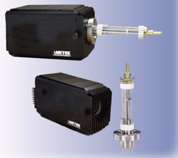
Analyzer head and electronics unit.