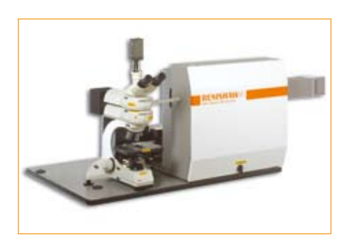
The inVia Raman microscope is ideal for those who want an entry-level system with the ability to upgrade to a fully automated inVia Reflex Raman microscope at a later date (Model illustrated includes optional eyepieces)