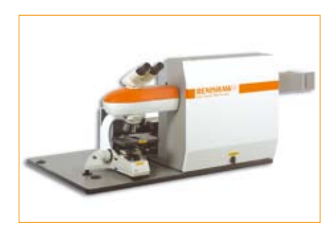
The inVia Reflex Raman microscope has all the proven performance of Renishaw's renowned RM Series Raman microscope, with the addition of full automation

Intermediate configurations can be matched to satisfy customer's needs fully, without compromising the ability to upgrade later to a fully automated inVia Reflex Raman microscope.